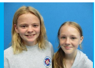
Pitsligo House Leaders