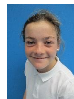
Pupil Council Secretary