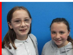
Dundarg House Leaders