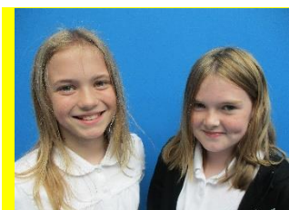
Brucklay House Leaders

Primary 7 were also very busy during week 1, writing letters of application to become House Leaders. Many pupils made some very important statements about their personal qualities, linking these directly to leadership skills. Many also connected these further to the school values, making the selection process incredibly difficult. We are delighted to share below our House Leaders for session 2022/23.