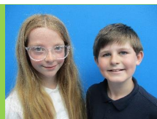
Cairnhill House Leaders